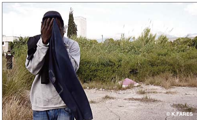
A Sudanese man who lives in an abandoned factory in front of the new port of Patras (June 2013).

Though Italy has the right to regulate access to its territory, the policies employed to combat irregular immigration must nonetheless respect the basic human rights of migrants, asylum seekers and particularly vulnerable subjects such as foreign unaccompanied minors. When it comes to readmissions from Adriatic ports, the numerous and detailed accounts collected during the course of this investigation prove how Italy systematically violates some of the basic precepts of its own national and international law, such as the ban on direct and indirect refoulement, on exposing migrants to the risk of inhumane and degrading treatment, and on collective expulsion.