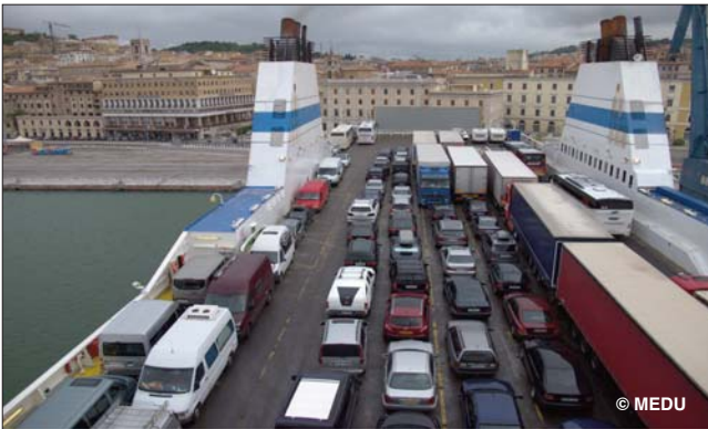
A ferryboat arriving in the Italian port of Ancona (May 2013)

From the official data detailing the first half of 2013 we can see that only half of the aliens detained at the Adriatic frontier posts was offered access to social and legal aid, as required by Italian legislation and provided by caregiving organizations present in all ports in line with the dispositions of the local Prefectures. This issue appears especially serious in those ports where caregiving NGOs have a reduced footprint. The reduced operating times for assistance and information services offered to migrants, and the fact that said operating times frequently clash with shipping timetables, means that approximately half of the aliens detained upon disembarkation deal exclusively with border patrol police or ancillary personnel. Thus, a crucial service for unaccompanied minors or asylum seekers is severely limited in the majority of Adriatic ports.