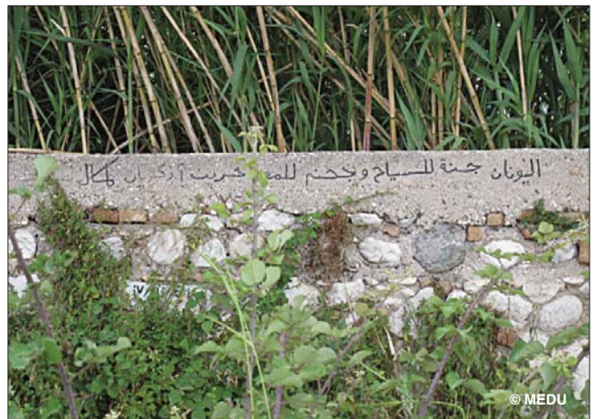
A written in Arabic in front of the new port of Patras: “Greece, a paradise for tourists, hell for migrants” (July 2013)

Medici per I Diritti Umani also believes a further reform of the Dublin Regulation by the European Union is necessary in order to ensure an adequate division of the burdens associated with the examination of requests for international protection among member states, giving preferential treatment to those factors which may connect asylum seekers with specific countries, rather than the current system of letting these fall upon the country of disembarkation. In this regard, the modifications laid out in the Dublin Regulation III, which will come into effect in 2014, do not seem sufficient in preventing the issues highlighted by this report, which have led and continue to lead to dramatic consequences for forced migrants attempting the Adriatic Route.