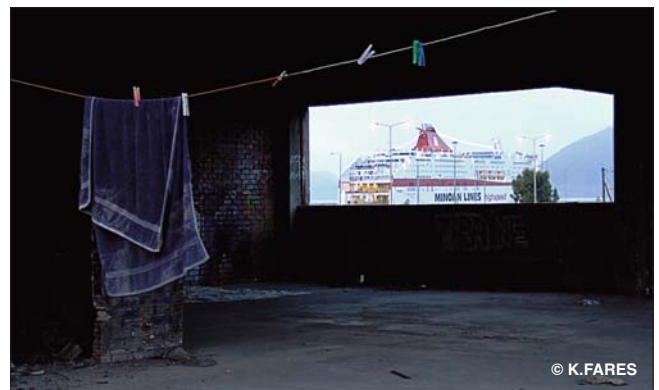
A room inside an abandoned factory used as a house in front of the new port of Patras (June 2013)

Readmissions from the Adriatic ports to Greece, which the Ministry of the Interior confirms it undertakes regularly, seem to be carried out summarily and with a grave disregard for the migrants' basic human rights by the Italian authorities, especially in the case of asylum seekers and unaccompanied minors. According to declarations made by the Ministry of the Interior, readmissions allegedly take place in accordance with the bilateral readmission agreement signed by Italy and Greece in 1999 – which, among other things, pledges both parties to respecting both the migrants' human rights and the relevant articles of the Geneva Convention on refugees. On the basis of the eyewitness accounts collected by MEDU, however, readmissions are undertaken in 80% of cases within a few hours, with the migrants being placed in the care of the vessel's Captain and returning to Greece on the same ship on which they arrived. This procedure is not countenanced in the