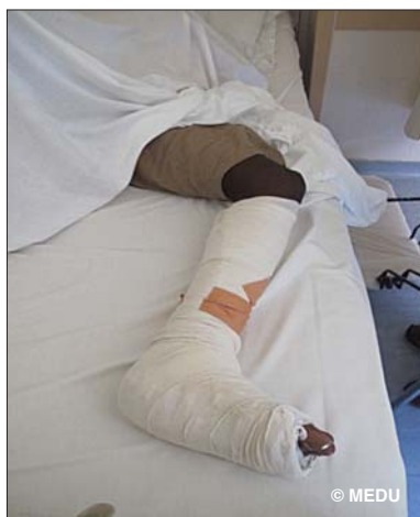
S. in the hospital of Patras with a leg in plaster (July 2013)

This investigation has further documented the acts of violence which migrants in Greece are subject to. Of the 185 migrants visited by MEDU's team in the temporary accommodation at Patras, 40% claimed to have been subjected to violence by the police (84% of cases) and xenophobic groups (16% of cases). Eighteen migrants, seven of which were minors of Afghan nationality, still bore the signs of the abuse they had suffered upon their bodies at the time of our visit.