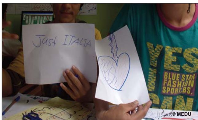
A written and a drawing made by two underage boys, readmitted in Greece as adult without being subjected to any medical examination (Patras, May 2013)

There was no translator. I talked to the harbour police using hand signals. I tried to make them understand that I wanted to stay in Italy. Using gestures, I tried to explain I was 15. They used hand signals too, to tell me "You're 20, you have to go back to Greece". M., 15 years old, Afghanistan 9