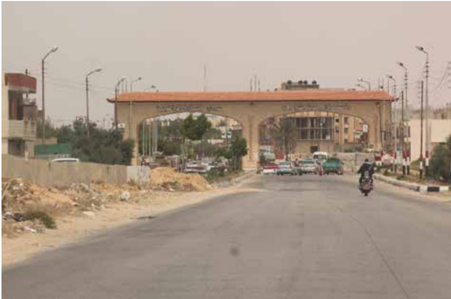
Figure 1: Checkpoint in Sheikh Zuweid, Sinai

On the other side of the Suez Canal there are cars waiting to drive them to the Sinai. They then drive north to Arish, the capital of the Sinai. They enter Sheikh Zuweid, which is where the lawlessness part of the Sinai starts, and then move further to Almahdia. From Almahdia, they travel all the way to the Raffa area, close to Gaza and the Israeli border. This is where the torture camps are located. There are many checkpoints on the way, and the cars with the hostages are easily identifiable. Pictured here is the last checkpoint, which is in Sheikh Zuweid.