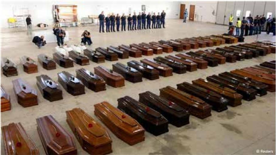
Figure 10: Lampedusa boat tragedy victims