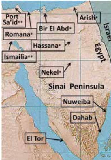
Figure 4: Map of Sinai Peninsula (Map: America Team for Displaced Eritreans 2013)

In the prisons it is the Sinai survivors who are criminalised, not the traffickers. In the detention centres and prisons the refugees live in very poor conditions, with very little food, no beds and no basic facilities. They only have access to very basic medical care. In such conditions they are still robbed of their freedom. They continue to have to pay to get phone time to collect their money and they are still collecting money to try and get out of detention. The soldiers profit from the little illegal trading that the refugees have to do to plan for their future.