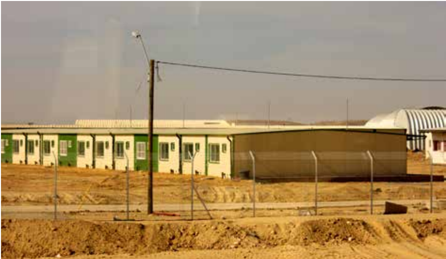
Figure 5: Open facility at Sadot, Israel

It is still unclear how it will be decided who will be sent to this new open facility at Sadot, but those that the authorities will want to transfer to the open facility will not receive permits to stay and will not be allowed to work. The facility will provide them with food, shelter and medicine. Once they are jailed, the refugees will be encouraged to leave ‘voluntarily’. Those who violate the conditions in the open facility (for example, not show up to one of the three daily roll calls in the camp) will be imprisoned in a closed facility. Sadot is located in the desert.