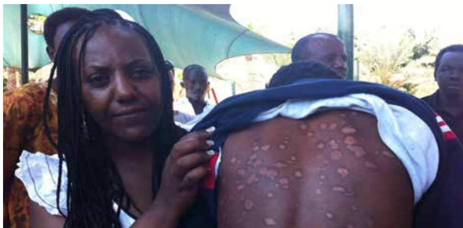
Figure 9: Sinai survivor with torture marks from plastic dripped on his back

In a desperate race against time, the Eritrean community living in the diaspora has managed to raise $41,000 demanded by Bedouin people-traffickers to buy the freedom of the girl's family.