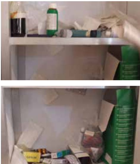
Figure 3: Medicine cabinets in the detention centre at Al Arish, the closest facility to the torture camps

The Sinai survivors who have endured so much do not necessarily complain much in the detention centres. However, conditions are hard. They are given little food (4 pieces of bread a day, sometimes a little more), which is often exchanged for phone credit. While there is some access to medicine and doctors, the medical treatment is entirely inadequate for the severe injuries of the survivors, which remain untreated.