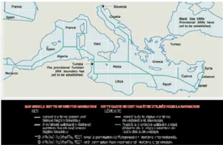
Figure 7: Map of SAR Zones in the Mediterranean Sea 290

In accordance with the SAR Convention, the seas are divided into search-and-rescue zones (SAR zones), each with its own coordinating party. This party provides and organises search and rescue services in its SAR zone. The Mediterranean is divided as follows: