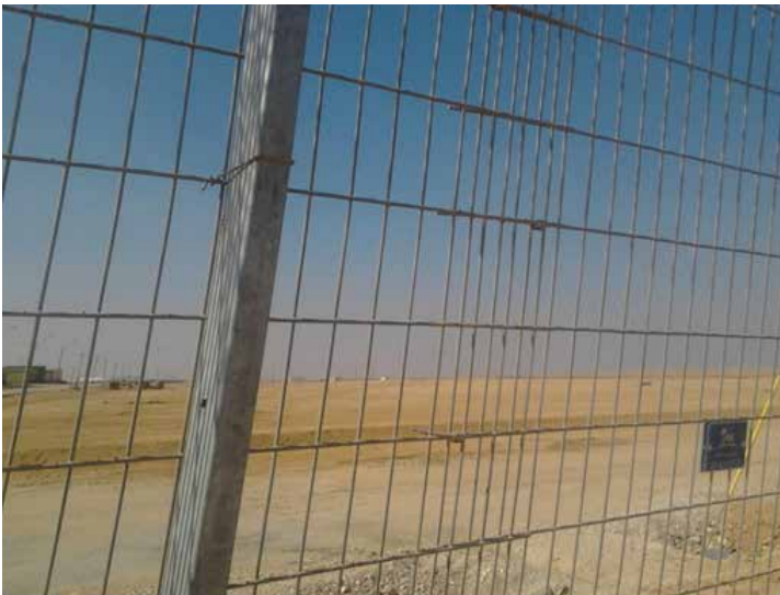
Figure 6: Open facility at Sadot, Israel (Photograph: Sigal Rozen, 21 November 2013)