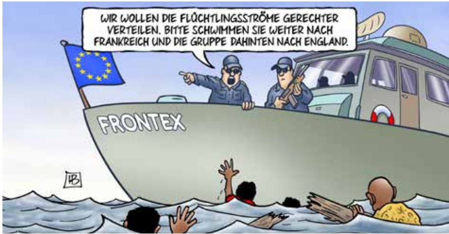
Figure 8: Caption (English translation): We want to distribute the flow of immigrants more equally. Please continue swimming to France and the group in the back to England. (© Harm Bengen, www.harmbengen.de )

In the past, Frontex has been heavily criticised, initially in relation to the HERA operations they conducted on the request of, and in cooperation with, Spain. 306 These joint operations (in which Spain, Italy, Portugal and Finland participated) were coordinated by Frontex and took place in the territorial waters of various African states to prevent illegal migrants from trying to reach the Spanish Canary Islands by preventing them from leaving the territorial waters of the African states. When these migrants were intercepted, they were 'escorted' by Frontex back to the African mainland and handed over to the authorities of those countries, even though such practices are prohibited under EU fundamental rights principles. 307 The migrants were, thus, prevented from applying for asylum and they could not appeal the decision to refuse entry, if such a formal decision had been made at all. 308