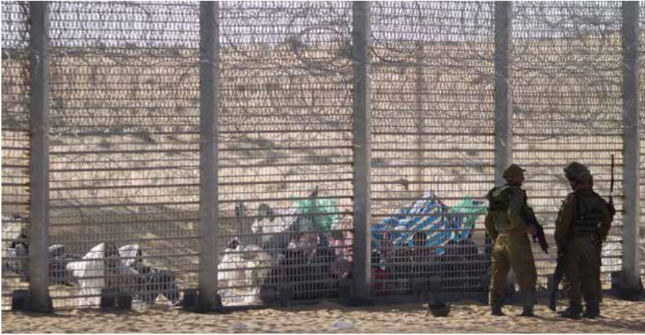
Figure 2: Sinai survivors and refugees on the Egyptian side of the Israel-Egypt fence

A heart-breaking testimony of what had happened by one of the two women was published by Rozen in 2012: