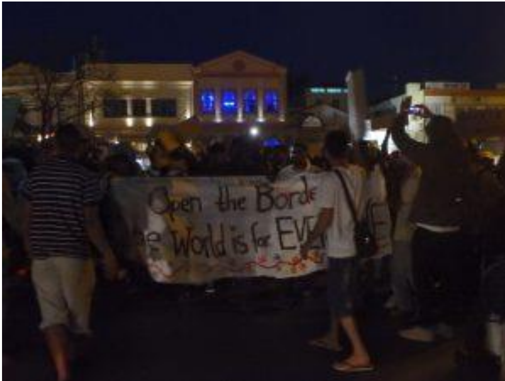
Noborder Protest in Mytilene.

Already for weeks, tensions on the Aegean islands run high after the Greek government announced to open three more so-called “hot-spots” only for “pre-removals” on the islands of Lesbos, Chios and Kos. They are, in fact, deportation prisons. Local residents and municipalities oppose these plans. At the same time, the atmosphere within the camps is boiling over. After months of waiting, the entire time threatened to be deported to Turkey, people have repeatedly protested against the imprisonment in inhumane conditions. It has been announced that, from November onward, weekly deportations to Turkey for 200 persons each time will take place, coordinated by Frontex. This would turn Lesbos into a deportation hub.