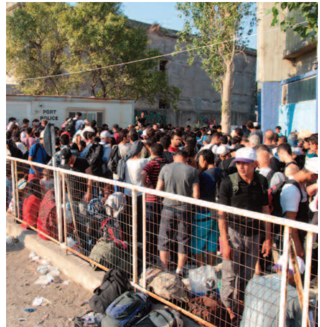
✕ PORT MITILINI POLICE 1 REGISTRATION

We feel solidarity and a strong connection with our friends in Greece, who have been confronted with the brutality of the European elites in another way. Their Oxi! gave us hope when most of us, after a long journey, tried to find a place in Europe, tried to figure out the relation to and within the European society. As new European citizens we demand equal rights for everyone. Obviously, not only migrants are nowadays used as scapegoats in Europe, but also those who say no to an austerity program without alternative.