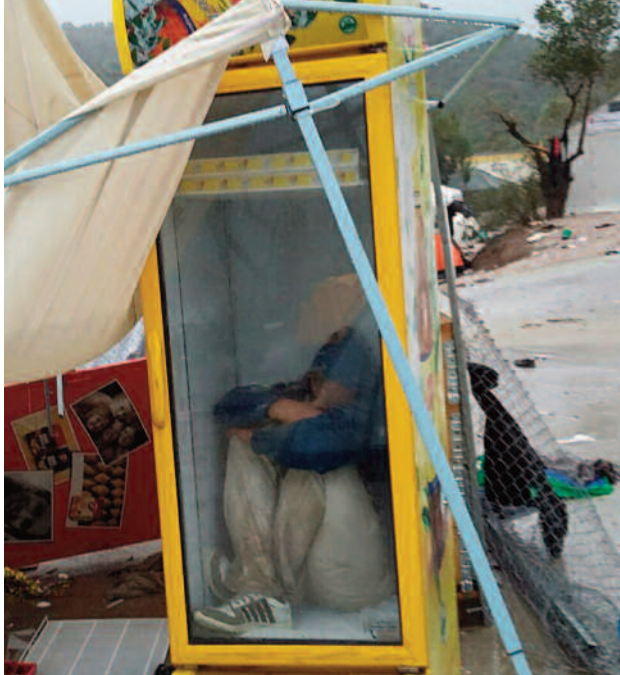
✖ MORIA, LOOKING FOR SAFETY EVEN IN REFRIGERATORS