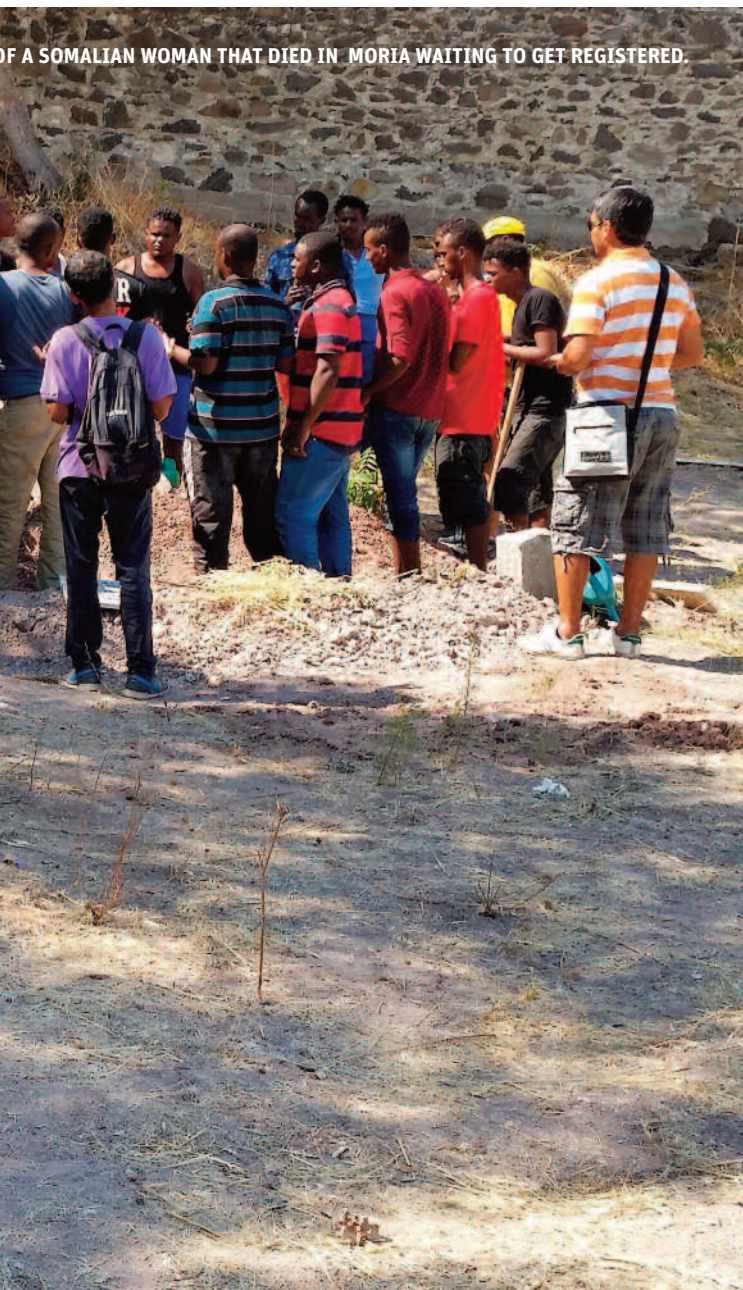
OF A SOMALIAN WOMAN THAT DIED IN MORIA WAITING TO GET REGISTERED.