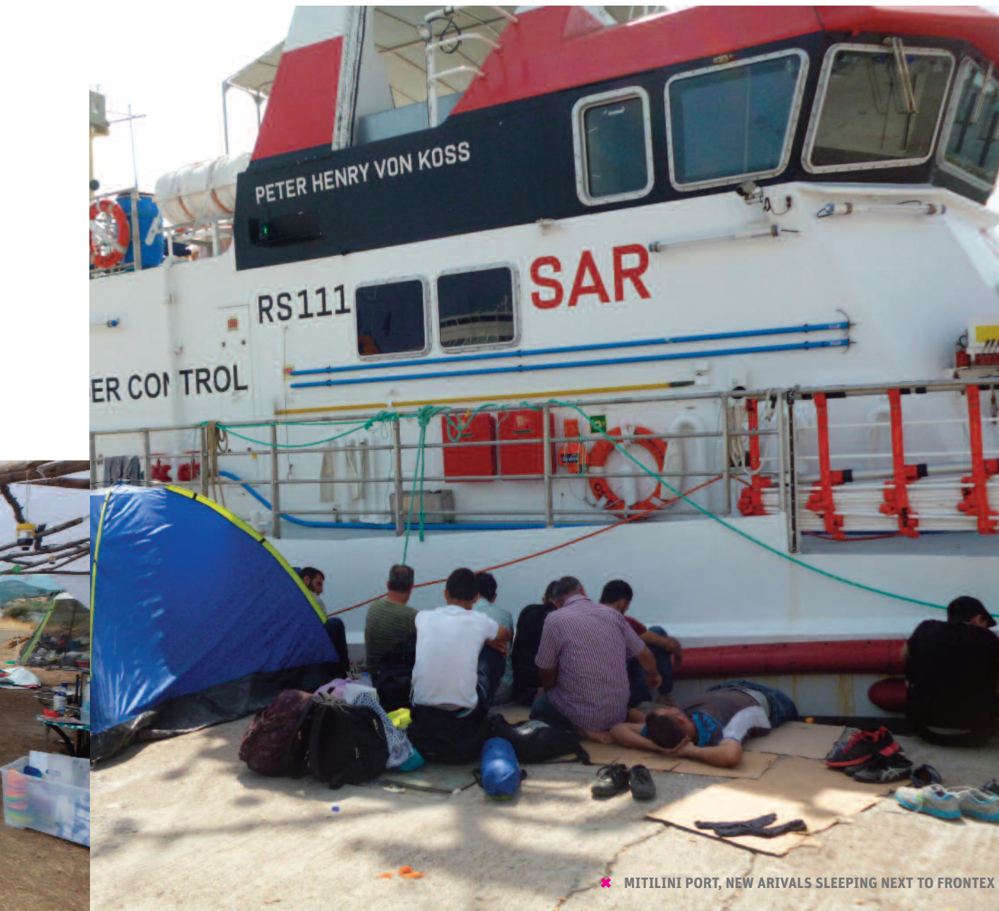
✳ MITILINI PORT, NEW ARRIVALS SLEEPING NEXT TO FRONTEX