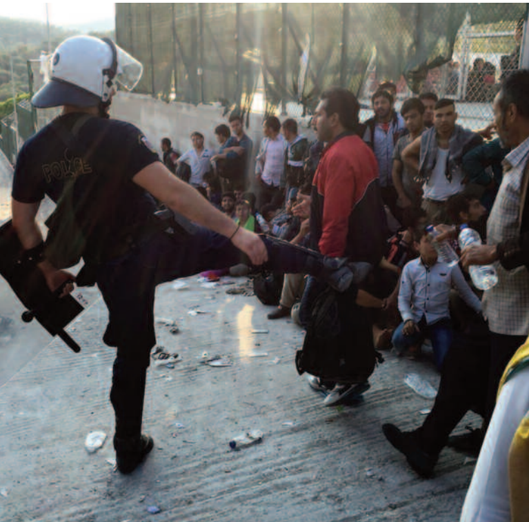
★ POLICE BRUTALITY IN MORIA TOWARDS PEOPLE WAITING FOR HOURS TO GET REGISTERED

I was surprised to see so many Kurds, I would have never thought that I would have to talk all the time. Another thing that I found impressing was one day when we picked up people on the beach who had just arrived. They stood on the road and it was a Kurdish family with a daughter, who fell in love with me, and I fell in love with her. We gave them a lift, she was thirsty and wanted to drink, and seemed to be somehow under shock. Then I saw her the next day when we had the concert, she was dancing all the time and when she saw me, she ran to me and didn't want to leave me. She cried when her parents wanted to take her back. She just didn't want to leave us. That is one of the things I will never forget. I think we did really well, and we have become so good that we can resolve most things better than any of the organisations that are all over the place now and don't really do anything. ★