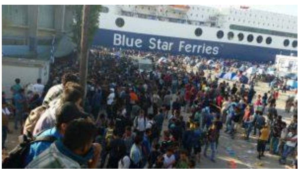
Mytilene Harbour, October 2015.