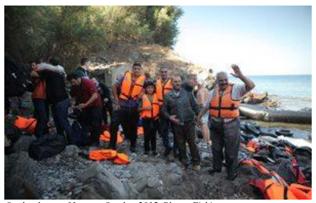
On the shores of Lesvos, October 2015.

What happened in 2015 along the shores of Lesvos was extraordinary. Many of the boats that landed on the beaches in the north and the south-east of the island had to be assisted. They were welcomed not only by the local residents of Lesvos, whose laudable efforts gained attention worldwide, but, latest from August 2015 onwards, also by people from all over the world, who came to Lesvos to help. In summer 2015, more and more initiatives became involved also in rescue operations, including anarchist groups from Athens, life-guards from Spain, Médecins Sans Frontières (Doctors Without Borders) who cooperated with Greenpeace, a German boat from Sea-Watch, and many others. Activists from Denmark and Spain were later criminalised for their courageous effort to save lives at sea. At that time, push-backs and violence at sea seemed to have disappeared in this part of the Mediterranean. Through the WatchTheMed Alarm Phone we were in contact with more than 1000 boats in the Aegean Sea. In the majority of the cases, we worked in close cooperation with networks composed of Syrian and Iraqi activists, who accompanied thousands of boats via WhatsApp and other digital technologies. At the same time, many people drowned in the waters before