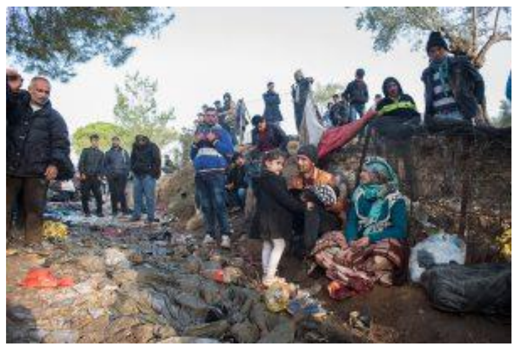
Outside Moria, October 2015.

Exactly one year ago, in October 2015, it was the time of the highest number of arrivals that Lesvos had ever seen. At its peak, 10,000 people reached the island in one day. In October 2015 we spent days mainly near Moria, mainly at night. Back then, the so-called "hot spot" was officially opened, during a time of heavy rainfalls. We were there while the UNHCR and all official NGOs had declared the area too dangerous for their staff. During these nights, only activists and volunteers, mainly women, tried to carry unconscious people out of the mud, covering at least the smallest babies with blankets. The situation last October was described as a humanitarian catastrophe. At the same time, we witnessed then already how EU border regime was trying to re-establish its control. In a common statement between Welcome to Europe and WatchTheMed Alarm Phone, we analysed and described the situation.