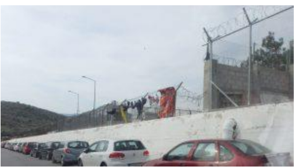
Outside Moria, October 2016.