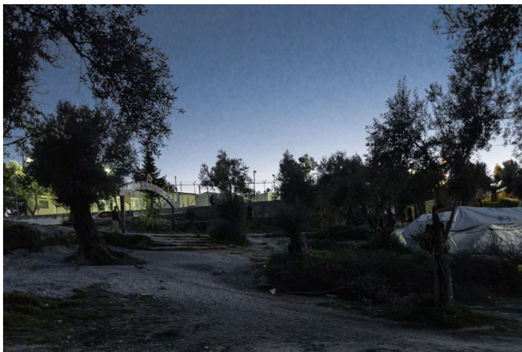
Outside the Hotspot of Moria