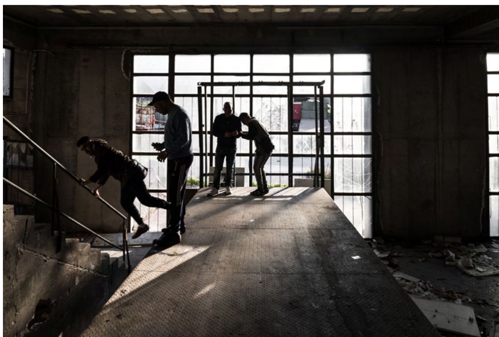
Algerian people living in an abandoned warehouse in Mytilene